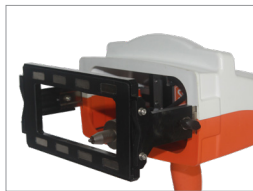
Front Fixture with V-groove&magnetic