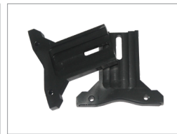
Independent Resting Legs