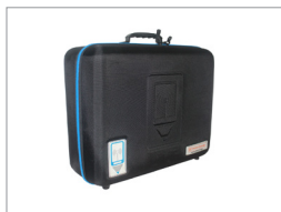
Carry Case for M-MARK53