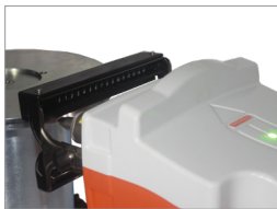
Flange Marking Attachment

Various accessories that can be applied on various materials and marking environments