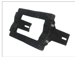
Front Fixture with V-groove