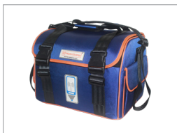
Carry Case for M-MARK155